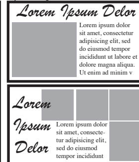
1/8 Page - $50