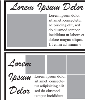
1/8 Page - $50