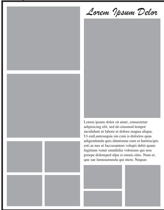
Full Page - $200