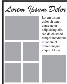
1/4 Page - $75